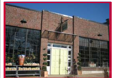
Bowood Farms at 4605 Olive in the Central West End is a great find! Great food at Café Osage , and great shopping in the nursery & gift shop!

And if all the properties come to fruition I will have a great year!